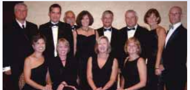
A group of friends from Kent enjoy the 2007 Robinson Memorial Hospital Jewel of Portage County Gala.